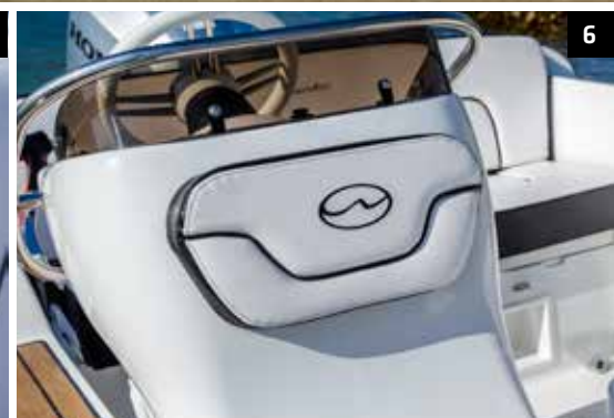
Console backrest cushion