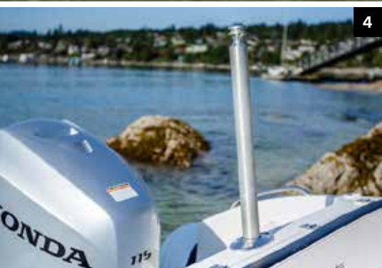
Retractable ski post (optional)