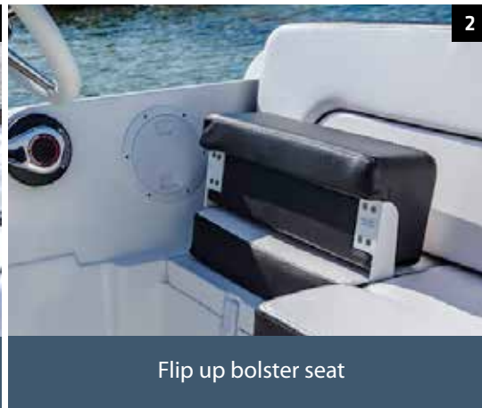
Flip up bolster seat